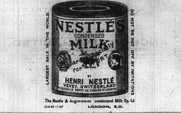
The Nestle & Anglo-Swiss Condensed Milk Co. Ltd. 0165-28 11-907 LONDON, E.C.

NAVAL & MILITARY CONTRACTORS. Chief Offices in Egypt: 31 Boulevard de Rameleh, Alexandria. P. O. BOX 805. TELEPHONE 1682. CAIRO Office: 18 Bab-el-Hadid. (Telephone 2588). TEA, PROVISION, WINE & SPIRIT MERCHANTS TEA MERCHANTS TO THE KING OF ENGLAND. Branches and Agencies Everywhere. LIPTONS have the largest sale of TEA in the WORLD on sale wholesale and retail at the Alexandria and Cairo stores, and can be obtained from P. Bless & Co., which firm is still managing part of the tea business. Head Office: CITY ROAD, LONDON.